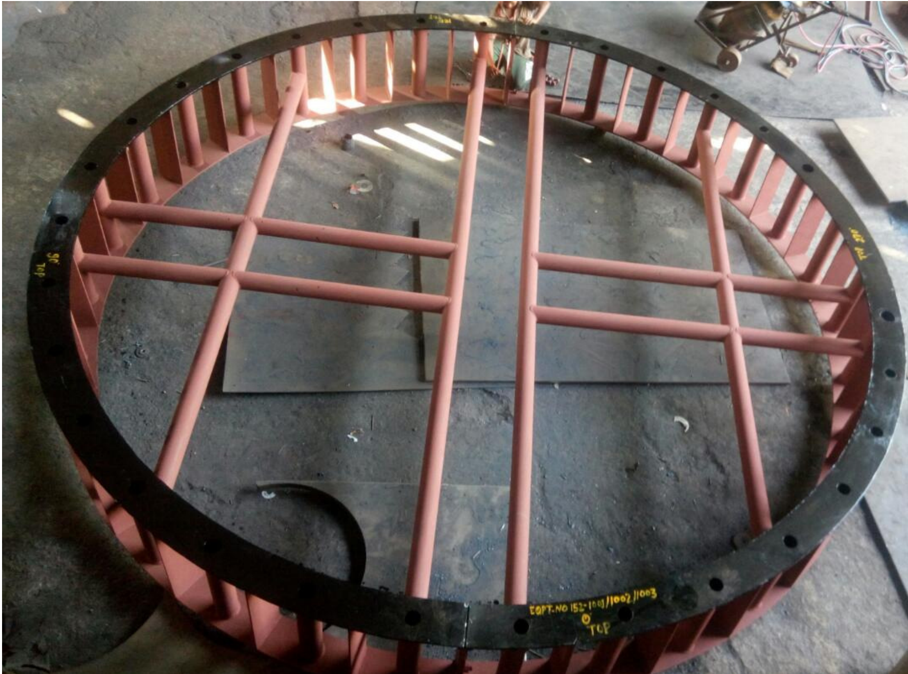
Foundation Ring Template for vertical vessels. Made for Godrej & Boyce Ltd.